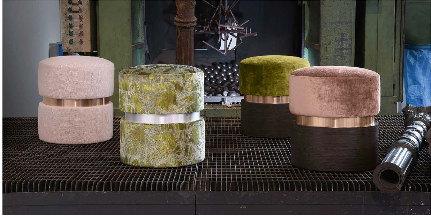
Two different versions for Tara: composed of two upholstered sections separated by a laminated wood ring, or a top upholstered seating section joined to a wooden bottom section by a chromatically contrasting wooden ring. A masterpiece of timeless elegance that will fit harmoniously into a residential setting or suit the most ambitious corporate project.