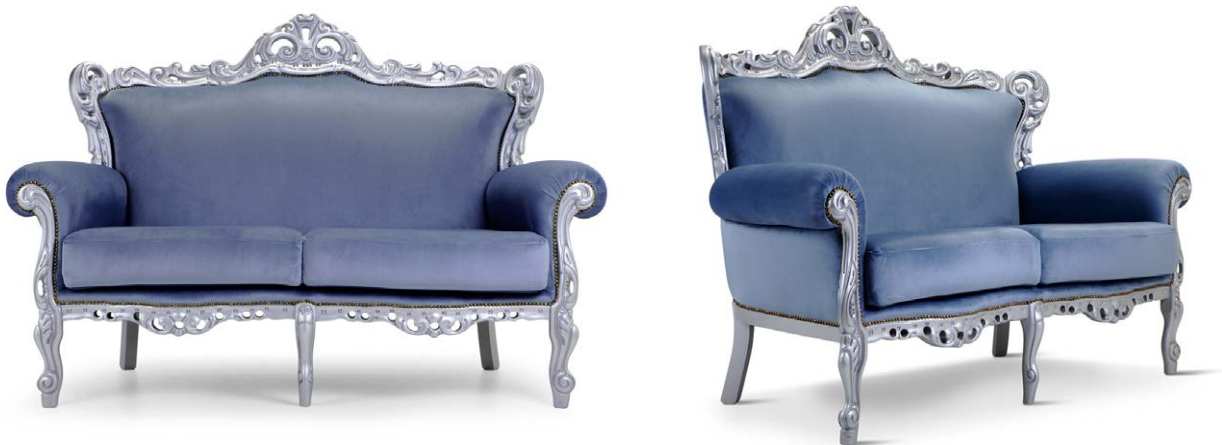
Barokko 2 seater sofa