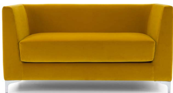
Lincoln 2 seater sofa