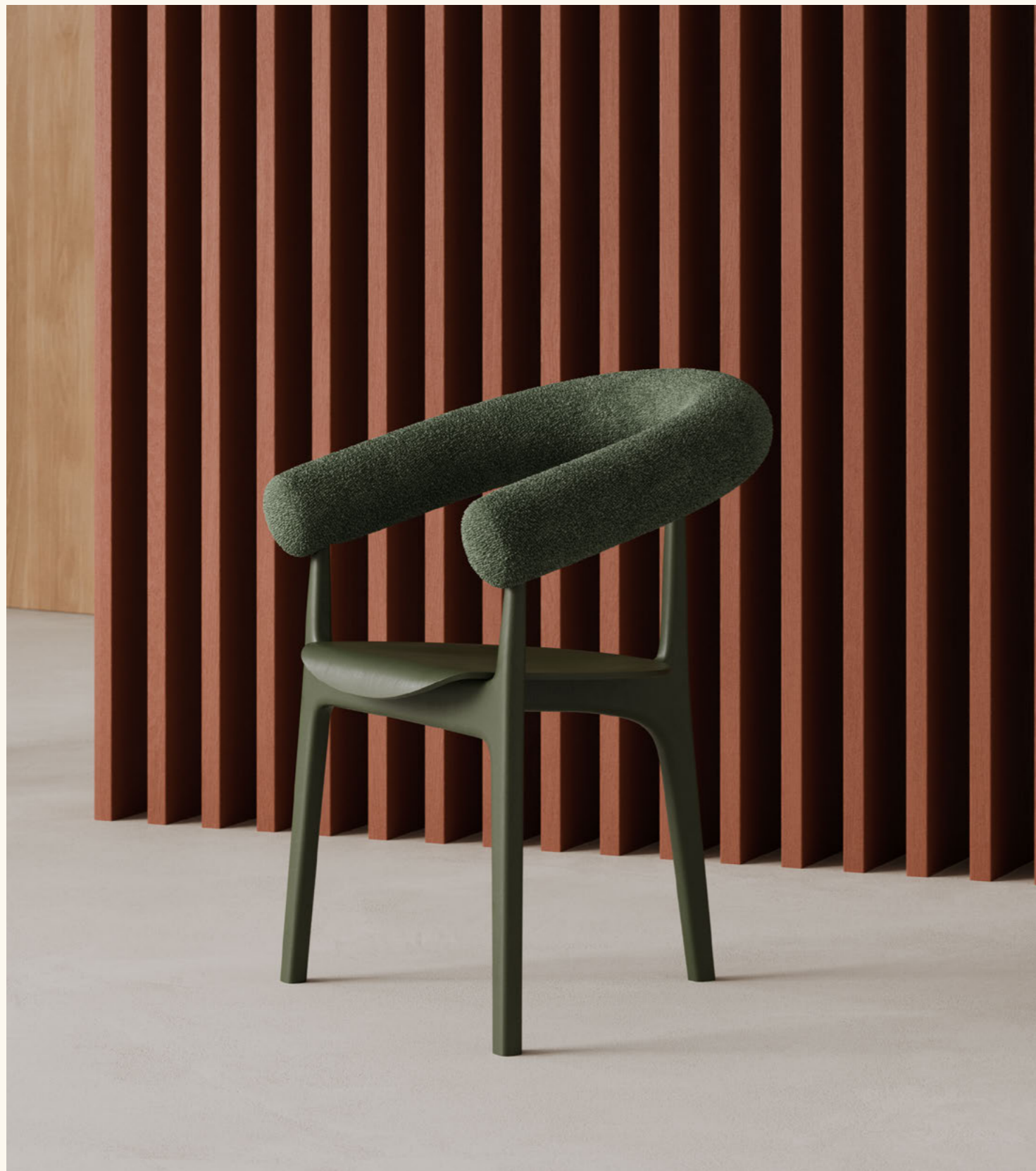
↑ Evo B-2948