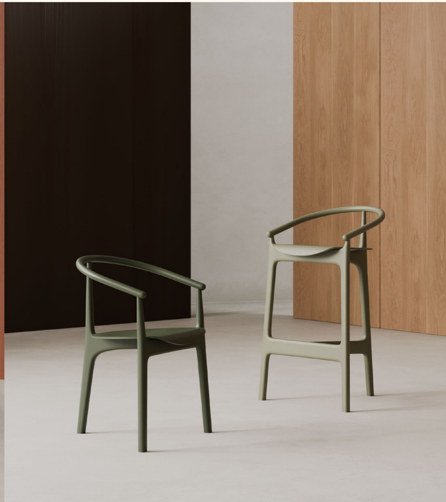
Evo B-2940 / Evo H-2940 ↑